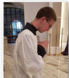
Bow of the Head

You should bow whenever you cross over in front of the tabernacle or altar (before, during, and after Mass). Bow to the tabernacle outside of Mass, bow to the altar during Mass. There are a few exceptions when you do not bow when you are crossing (defer to the training videos for clarification). There are two types of bows: